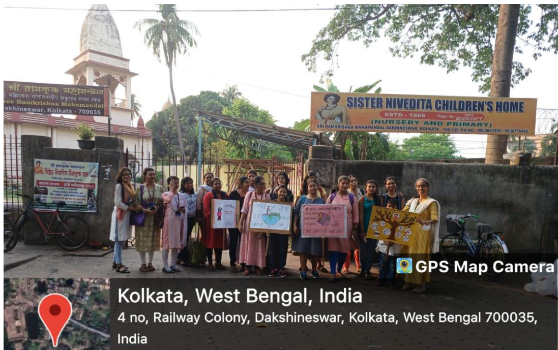
Volunteers with placards

The NSS unit organized an Environment awareness program with the students of Sister Nivedita Children's Home. We taught children about the environment and how to take care about it in order to maintain a balance in the nature. Our volunteers gave speech with a view that students find it interesting and can understand them. And we concluded the day with creating awareness through placards.