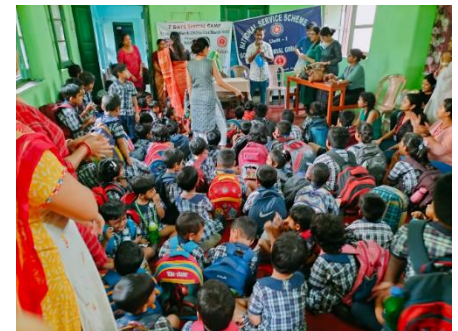
Distribution of Consolation prize