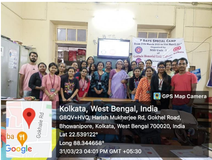
Principal with all volunteers

Also, the principal distributed the certificates to the volunteers of our NSS unit.