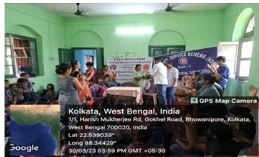
Distribution of gifts to School faculty members