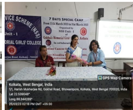
Felicitation of the Guests