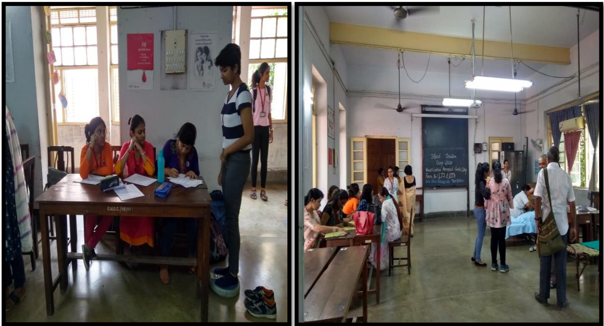
Few glimpses of Blood Donation camp