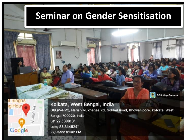
Seminar on Gender Sensitisation