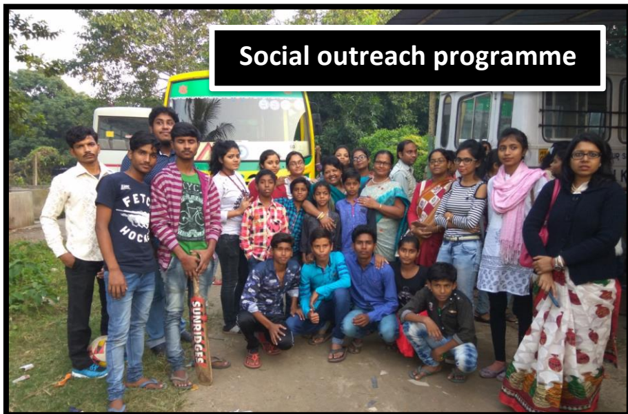
Social outreach programme