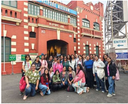
In Front of the Museum