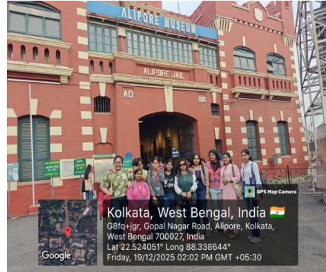
Alipore Jail Museum