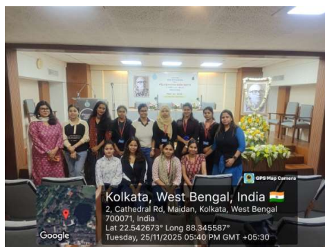
With the Students