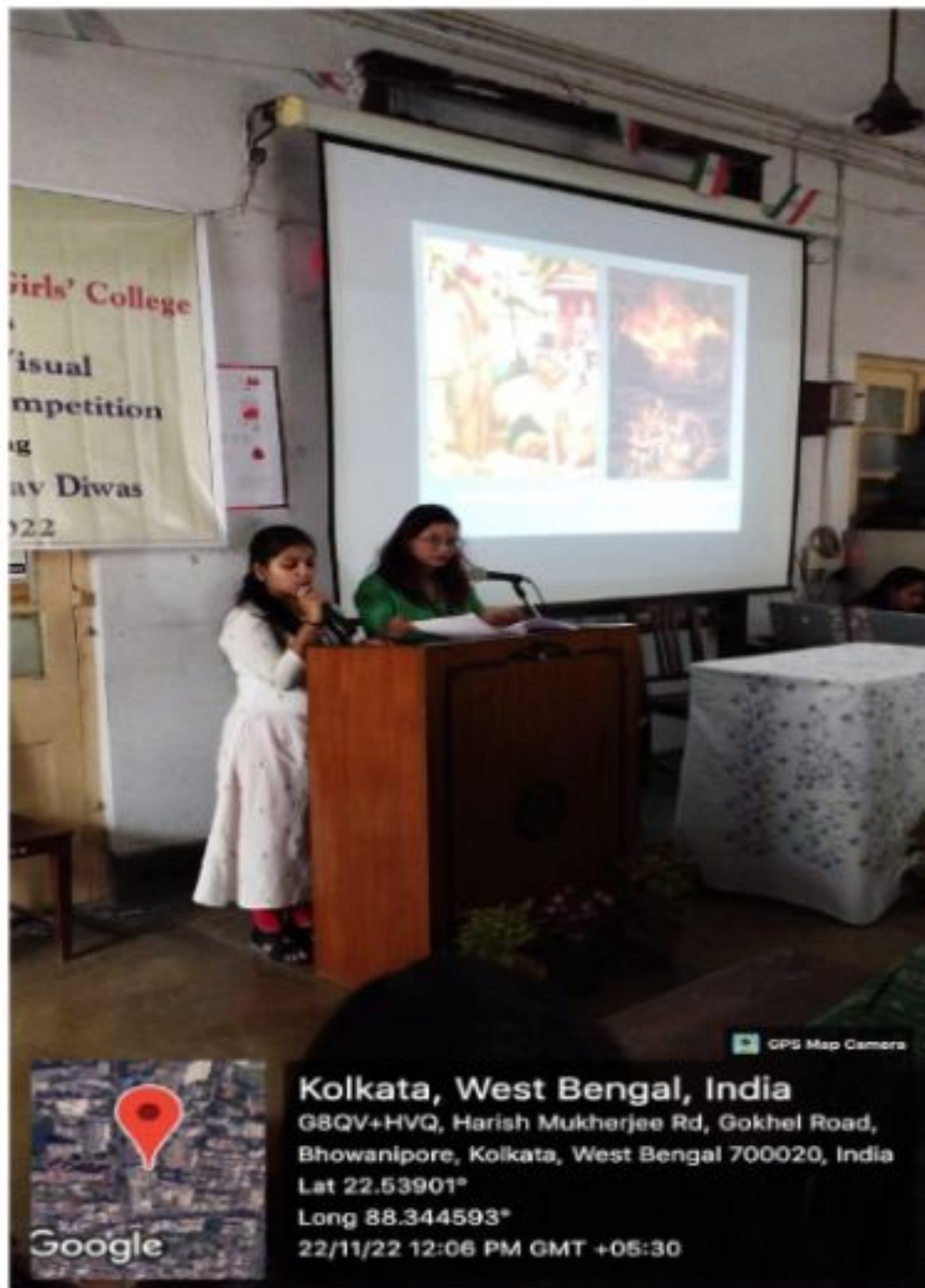
Students Presenting at Janjatiya Gaurav Divas