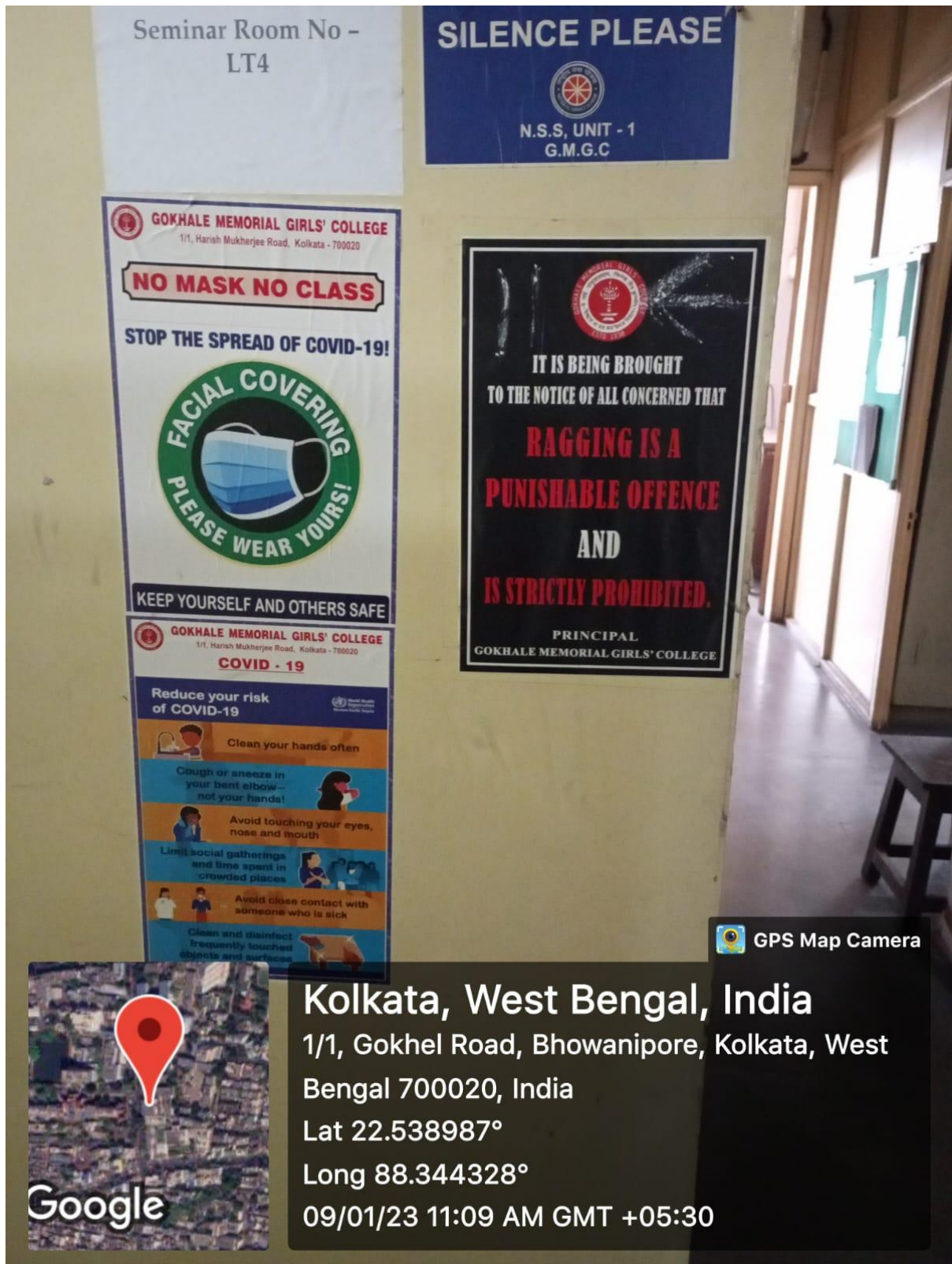
Anti-Ragging Awareness in the Campus