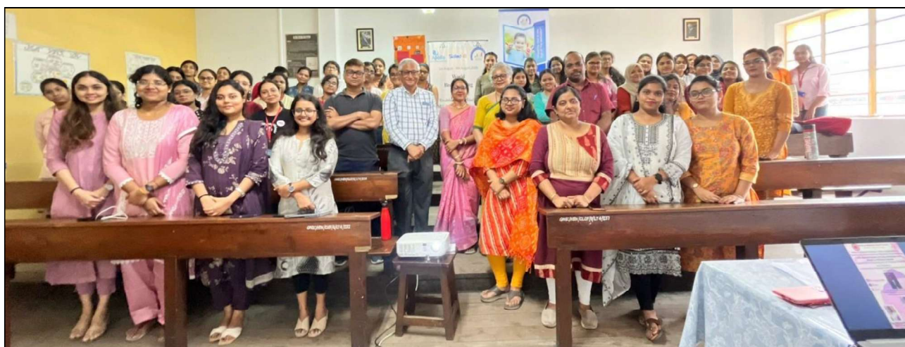
Group Photo including all the Participants