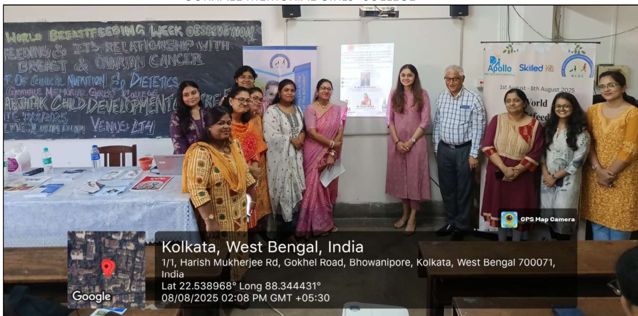
Group Photo with NCDC staff, CNDV Dept. Faculties and Psychology Dept. Faculty